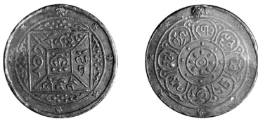
T 10 1/8 Sho-gang Actual size